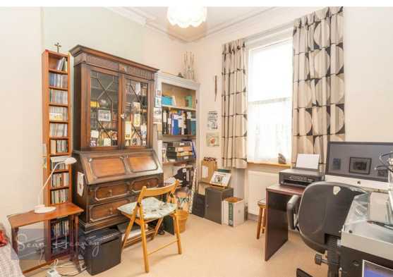
Loft Storage 10'2" x 8'7" (3.10m x 2.62m)